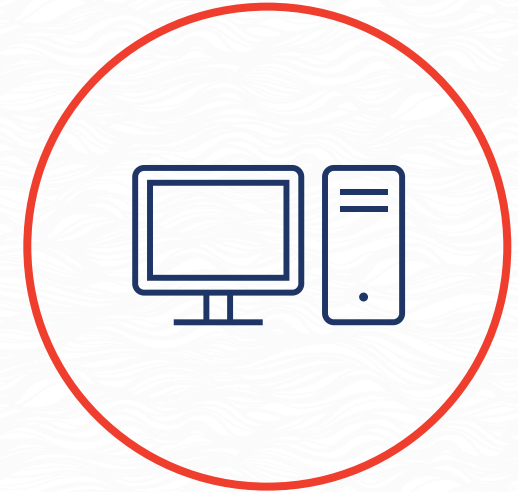
Information Technology (IT)